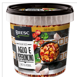
Aglio e peperoncino 1000g